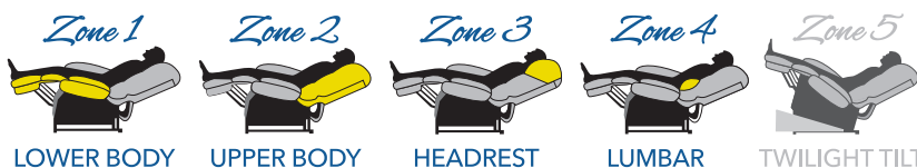
LOWER BODY UPPER BODY HEADREST LUMBAR TWILIGHT TILT

Comfort Zones 1 - 4 provide an ergonomic comfort experience with an emphasis on head and back support. Each Comfort Zone can be adjusted independently by using the exclusive AutoDrive hand control.