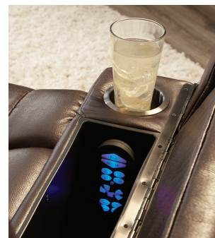
Right Arm: Cup Holder & Storage Compartment

The Rhea comes standard with the following comfort and convenience features: